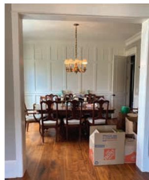
< Dining room (Before)