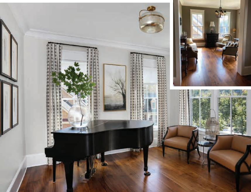
The piano room (Before) >