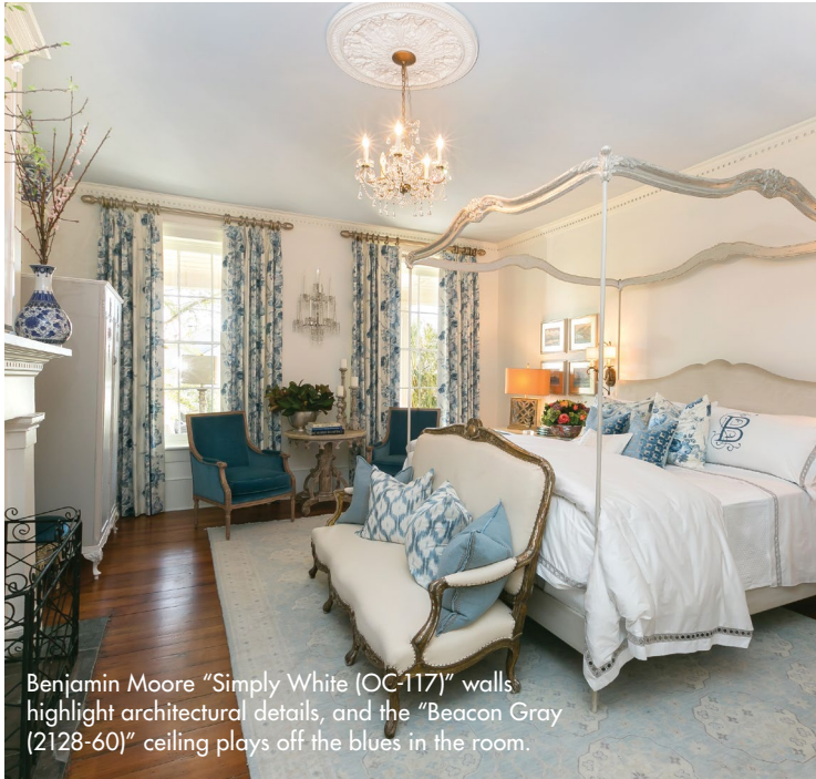
Benjamin Moore "Simply White [OC-117]" walls highlight architectural details, and the "Beacon Gray (2128-60)" ceiling plays off the blues in the room.