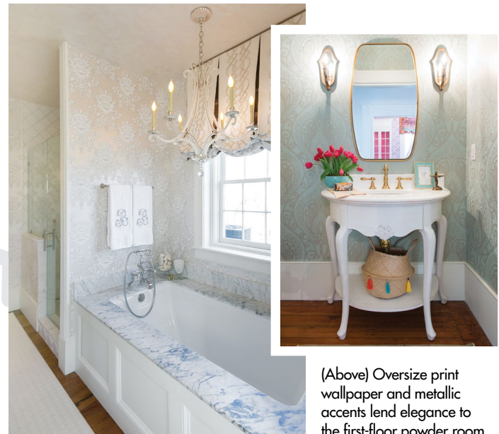
(Above) Oversize print wallpaper and metallic accents lend elegance to the first-floor powder room.

TCB Design Interiors: (843) 817-0432, tcbdesign.net